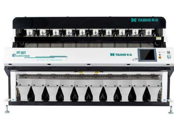
OBSERVATION Series Color Sorter

أكتوتريد هي واحدة من الشركات الرائدة في مجال الآلات الزراعية وصناعة الانتاج الغذائي في مصر و افريقيا والخليج العربي , ولها تاريخ يمتد لأكثر من ٢٥ عاما, وقد قادت شركة أكتوتريد السوق في مجال صناعة الانتاج الغذائي من خلال تقديم وتوفير أحدث واجدد الآلات والمكينات من جميع انحاء العالم وتقديمها للسوق المحلي والافريقي والخليج العربي , حيث ان شركة أكتوتريد تسعى جاهدة لتوفير أحدث الآلات بأعلى جودة وتكلفه مناسبة لعملائها.