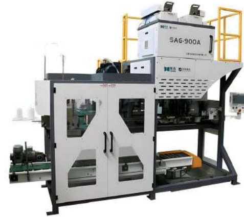
PackUnion Pack Machine

تتميز شركة أكتوتريد بريادتها في مجال التعبئة والتنقية في مجال الأرز والحبوب والبقوليات وذلك من خلال التعامل مع التوكيلات التجارية العالمية ذات الجودة والسمعة المتميزة بجودة المنتجات و كذلك خدمة ما بعد البيع وتتعامل شركة أكتوتريد مع شركات عالمية .